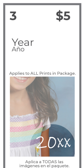
A LA CARTE